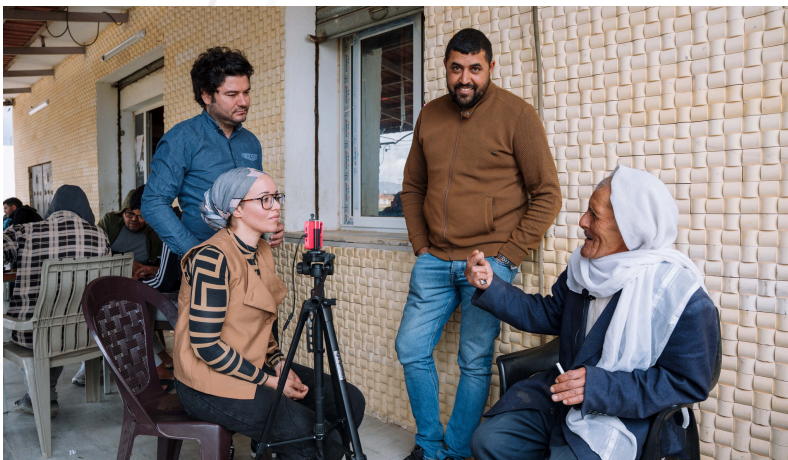
Photo: journalists from Radio Sufetula in the Sbeitla region, in the governorate of Kasserine, produce a report on residents' concerns.

Digital presence is strengthened through the development and production of video formats.