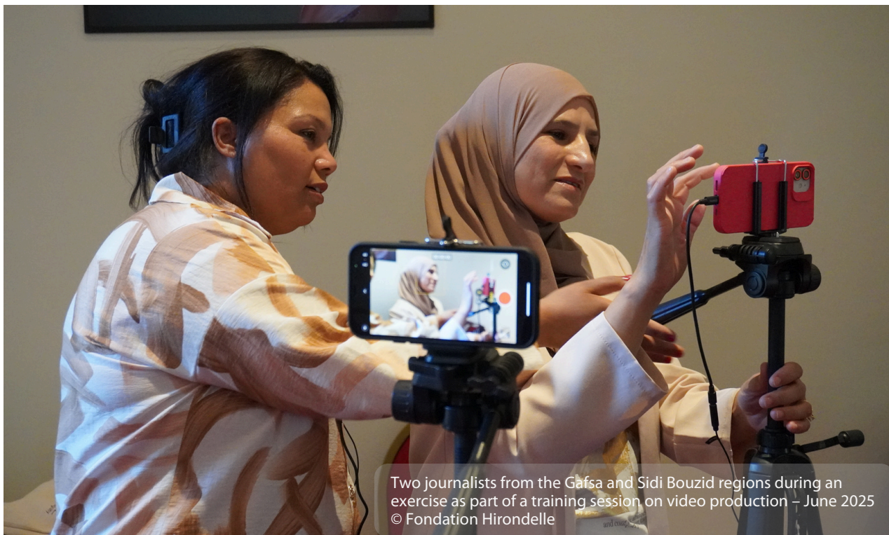
Two journalists from the Gafsa and Sidi Bouzid regions during an exercise as part of a training session on video production – June 2025