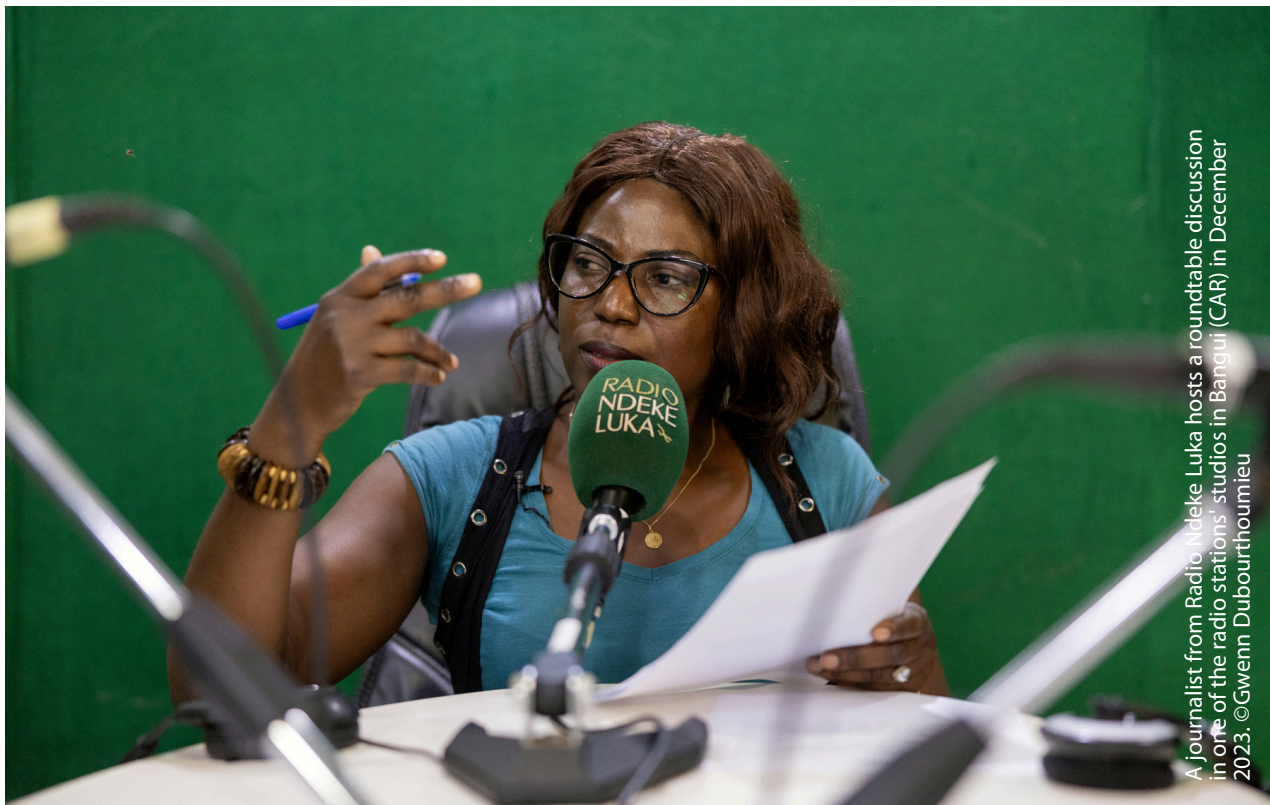
A journalist from Radio Ndeke Luka hosts a roundtable discussion in one of the radio stations' studios in Bangui (CAR) in December 2023.