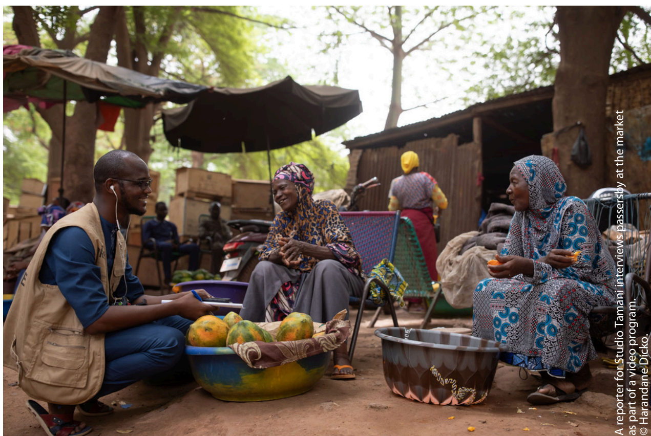
A reporter for Studio Tamani interviews passersby at the market as part of a video program.