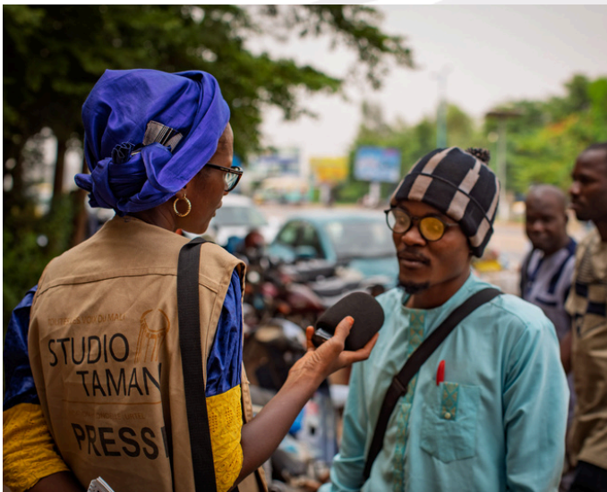
A reporter from Studio Tamani is gathering the views of members of the public on the suspension of political parties in Mali as part of a street interview.

With a reduced number of partner radio stations and growing social media penetration in Mali, Studio Tamani will continue to improve its online presence. The website will be redesigned, with better integration of audio and digital content on social media.