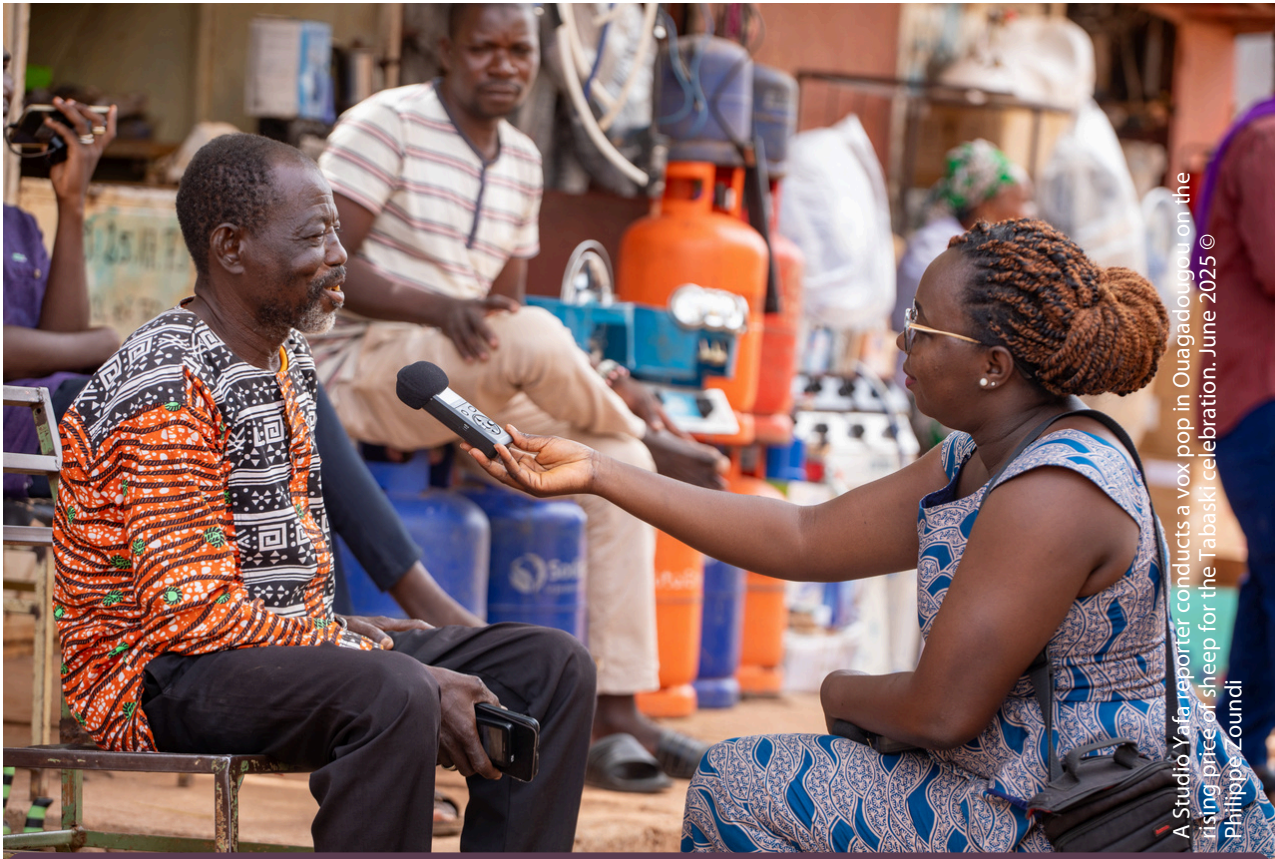
A Studio Yafa reporter conducts a vox pop in Ouagadougou on the rising price of sheep for the Tabaski celebration. June 2025