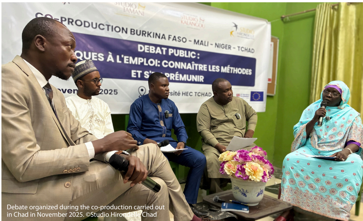
Debate organized during the co-production carried out in Chad in November 2025.