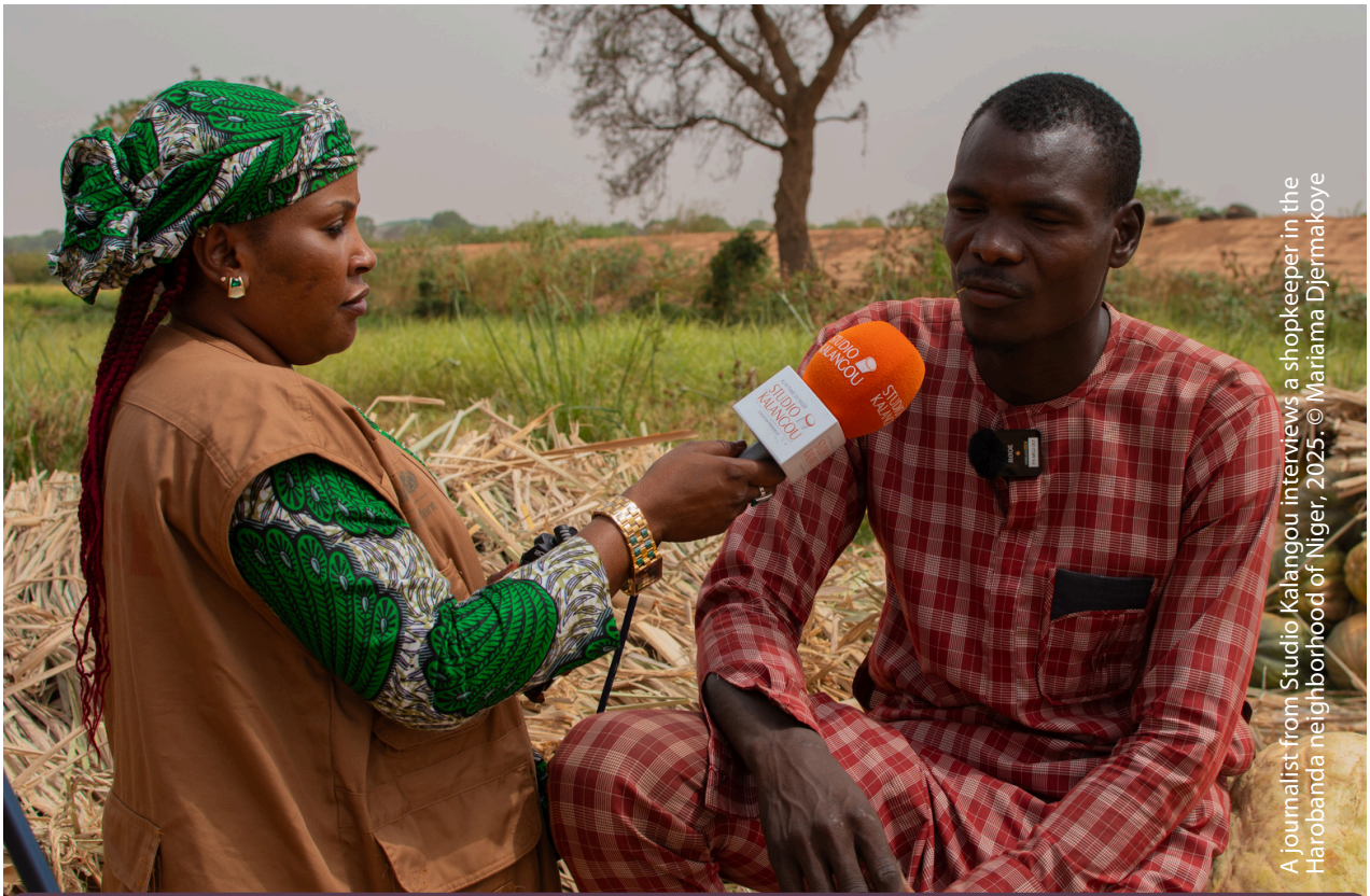
A journalist from Studio Kalangou interviews a shopkeeper in the Harobanda neighborhood of Niger, 2025.

Since 2022, Studio Kalangou is certified by the Journalism Trust Initiative