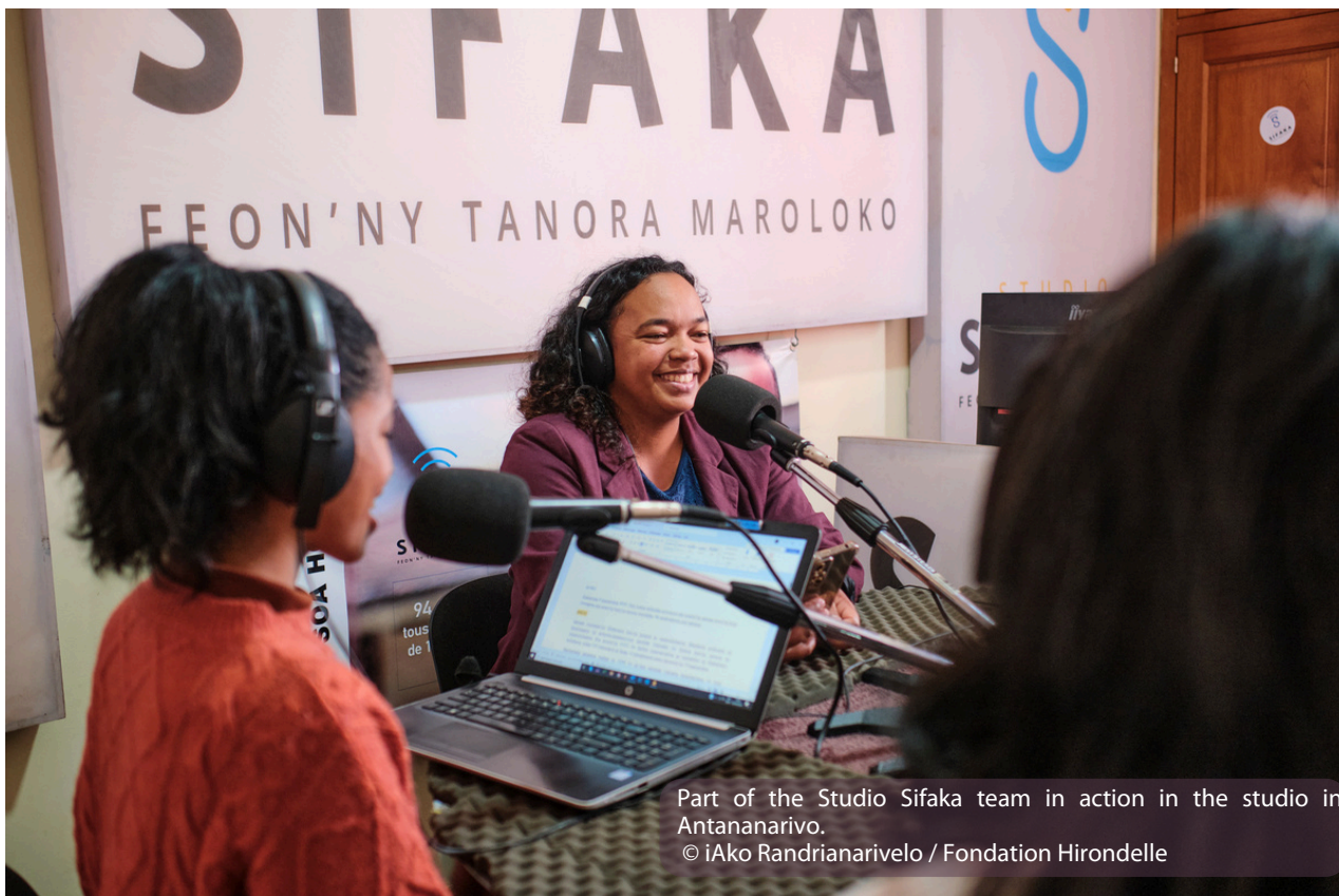
Part of the Studio Sifaka team in action in the studio in Antananarivo.